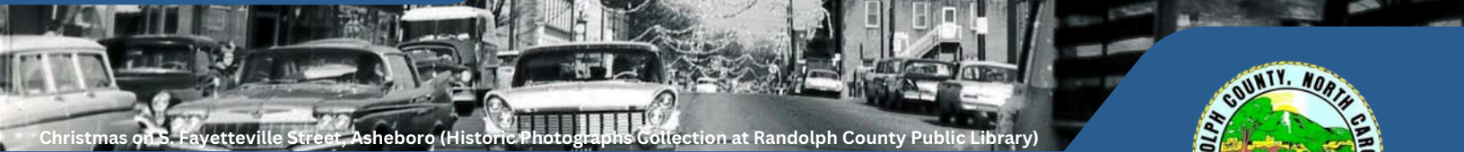
Christmas on S. Fayetteville Street, Asheboro

Be in the know when it comes to your county!